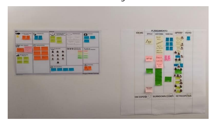
Figure 3. Scrum and PM Canvas filled at the end of one meeting.

The weekly meetings took place for four weeks. The meetings usually started with an analysis on the PM Canvas, to define the next tasks and when they should be delivered. After that, the tasks performed on each working day of the week were counted and compared with the past count. The last phase of the meetings was reserved for the scrum ceremonies. The Figure 3 shows a filled scrum and PM Canvas by one of the PBL teams.