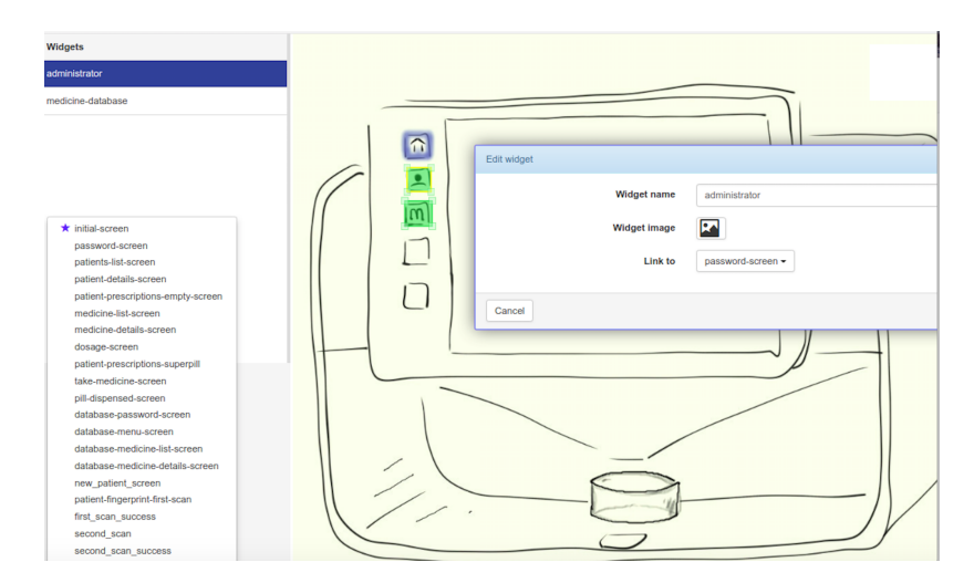
Fig. 3: Phase of the creation of the initial sketch design using PVSio-web.