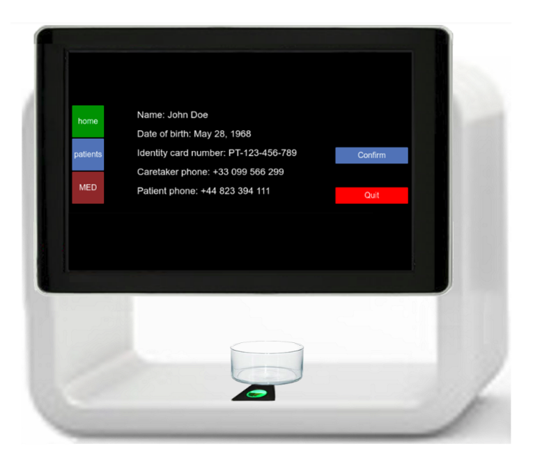
Fig. 4: Pillbox prototype based on concept design image.