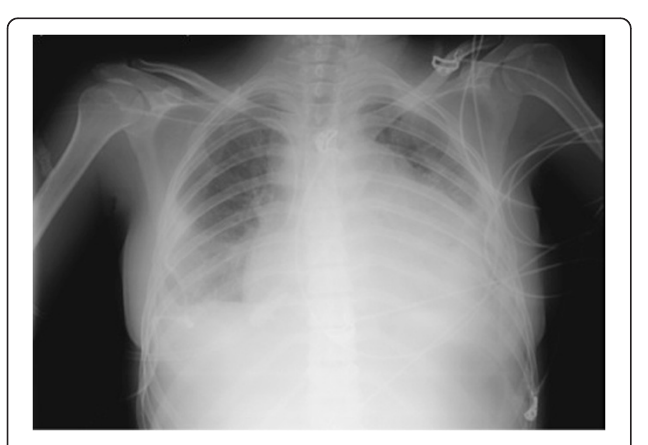
Figure 1 Chest roentgenogram showing cardiomegaly and right pleural effusion.