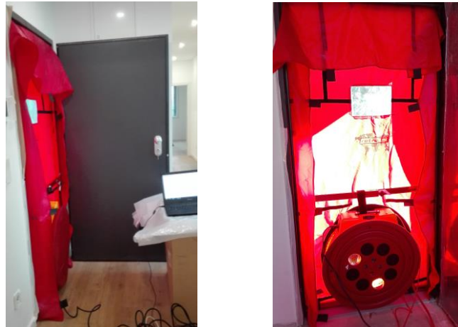
Figure 3: Blower door setup for in-situ airtightness measurement

In the in-situ case study, the airtightness measurements occurred during the construction stage and at commissioning. The tests were performed with the blower door Retrotec1000 model (Figure 3), following the procedure described in the standard EN13829-2000.