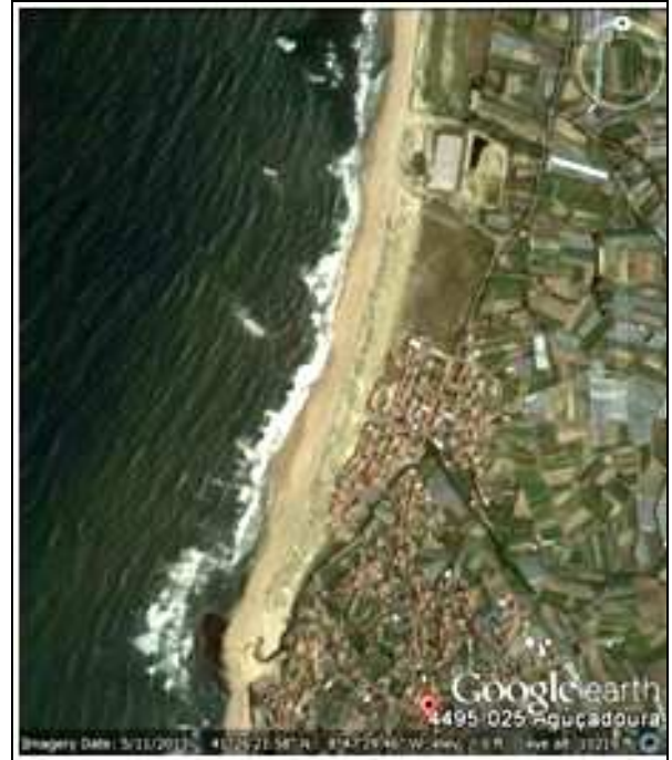
Figure 2. Aguçadoura beach (Source: Google Earth Pro image, 2013).

The Aguçadoura and Ramalha beaches are the famous tourist destinations. located in the city's rural outskirts, Aguçadoura is the best surfing beach of the city of Póvoa de Varzim, with a large dune area, making it the longest beach in Póvoa [8]. Ramalha beach also displays a very extensive sand and well preserved dune system [9].