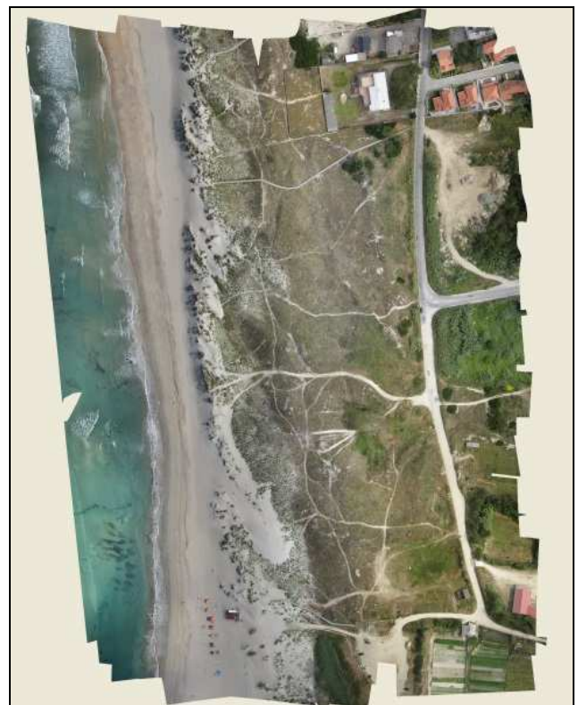
Figure 6. Orthophoto of the Ramalha beach (2014).

According to the complete workflow of the Agisoft PhotoScan Professional we generated the 2D georeferenced orthophotos and 3D digital elevation models of Aguçadoura and Ramalha beaches (Fig. 6, 7, 8, 9).