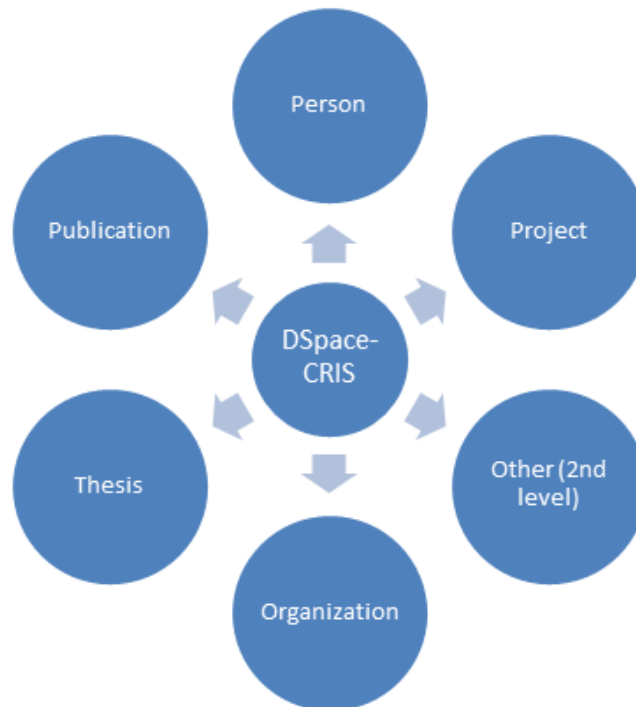
Fig. 2. Methodology of implementation

and a list is provided to be imported. If the name matches the author name already on the system, a connection will be made to associate this author with the ORCID account; c) Projects - The projects already exist integrated with an authority control functionality and will also be available with more information, a project page (as entity), of the projects of the institution; d) Organizations - The organizations will be identifiable in the future with ISNI numbers; and d) Other - For the pilot of DSpace-CRIS, other entities will also be exploited such as journals, events and datasets associated with the publications.