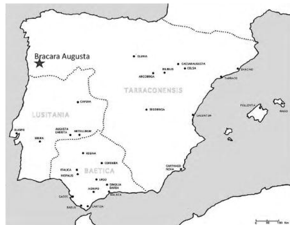
Fig. 3. Location of Bracara Augusta theatre in the context of Hispania theatres distribution, according with Sear, 2006, Map 3.

enriching at the beginning of the second century. These events justified the great investment the city witnessed with the construction of several public buildings as the theatre and the amphitheatre 7 .