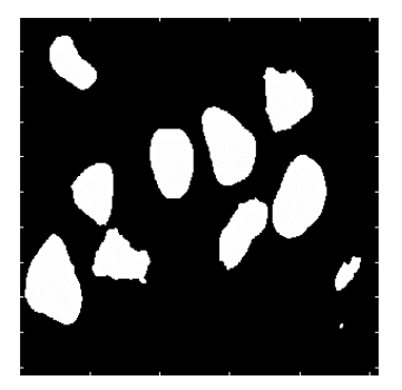
Figure 3. Binary image of the picture from Fig 2.

used a MATLAB's own function, which originates a image with the contour of the object. However the contour of the objects provided is a 2 pixel wide contour and not a 1 pixel contour as expected. On cause of that some (few) objects with more irregular shapes are not identified.