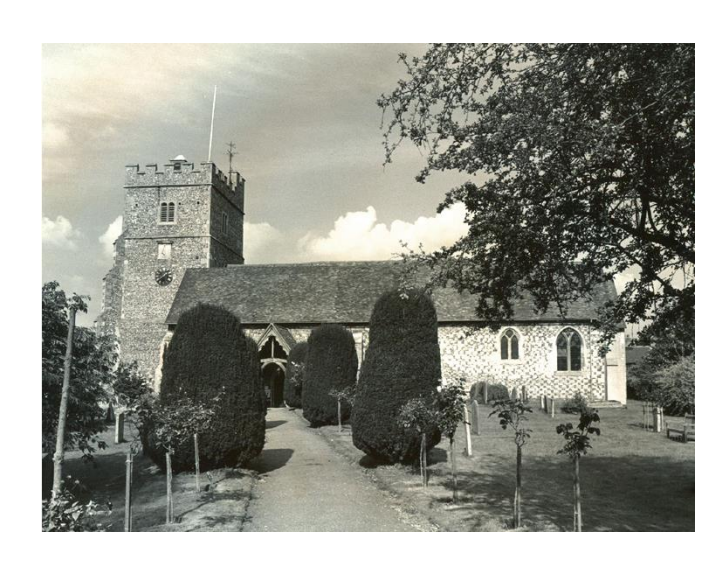
Picture 5. The 15th century church of St Michael's, housing monuments to generations of the Russell family