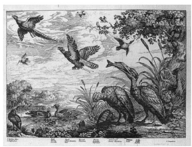
Picture 6. Richard Maitland de Lauderdale, circa 1700, Birds by a Pond

The estate, the personified natural surroundings, and indeed the women of the place, including the patroness, blend into a locus amoenus (literally, a 'mild place'):