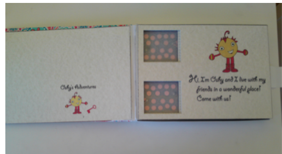
Figure 1. The book placed on the electronic platform, opened on the first page.

Each card has an electronic tag on its backside that allows the system its detection and identification. There are plenty of technologies that could be used to accomplish this task, from the simplest ones such as electronic physical contacts, to more complex ones ranging from infrareds, RFID, or even a Wi-Fi sensing technology.