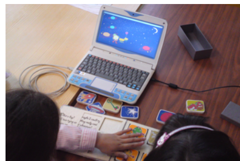
Figure 4 -7. Children interacting with the platform

All were very enthusiastic about the book, especially about the communication between the cards and the computer. They were all successful in following the unfolding narrative of the book and creating their own story version with the cards they chose. An interesting observation was that when they reached the last page, the one without text and just with the six slots, instead of creating a new story version rearranging the completed story by changing