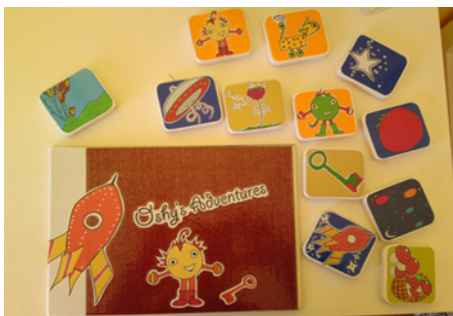
Figure 3. The book with some cards.

The current prototype was tested with a small group of 8 children aged 5. They interacted with t-books in pairs of two. A facilitator read the story and the children were invited to follow the narrative by choosing the cards they liked and place them on the slots according to the unfolding narrative.