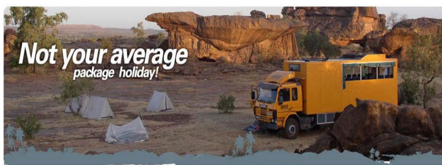
Figure 2. Image of an 'alterative' overnight