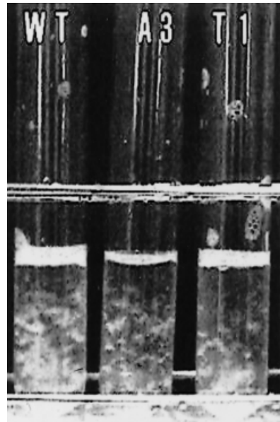
Fig. 2 Visual aspect of the flocculence ability from the strains: WT – S. cerevisiae NCYC869 A3 – S. cerevisiae NCYC869-A3 T1 – S. cerevisiae NCYC869 A3/pYAC4

In brief this study has demonstrated the feasibility of the transformation of Saccharomyces cerevisiae cells by the lithium acetate method plus single-stranded carrier DNA with a yeast artificial chromosome plasmid (pYAC4). This facilitates greatly the YAC manipulation required for a wide variety of applications. To our knowledge this is the first time that a flocculent Saccharomyces cerevisiae strain has been transformed. The present methodology will allow for genetic studies in flocculent strains such as those strains used in the brewing industry.