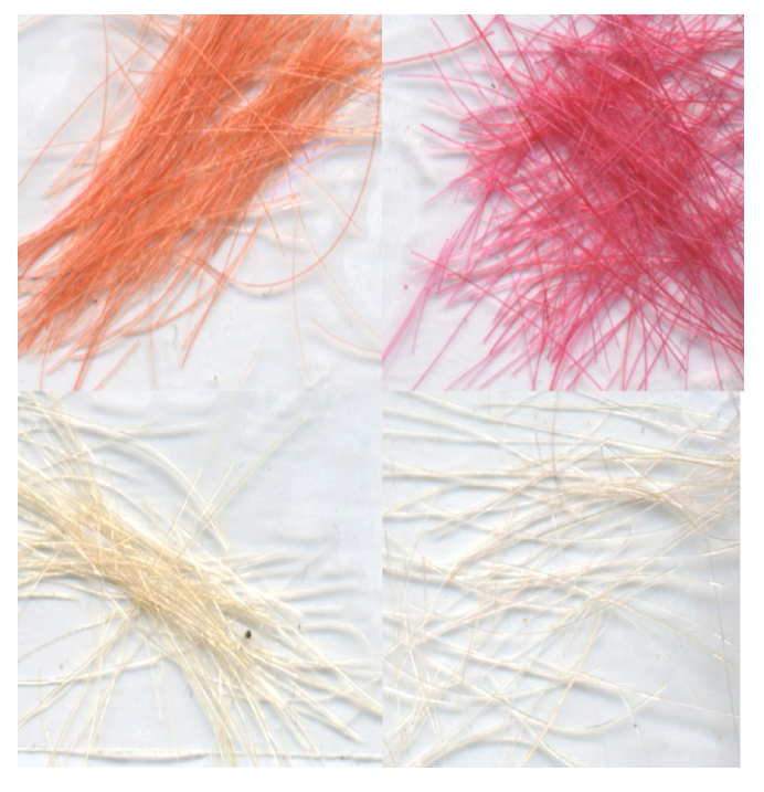
Fig. 3. Decolorization of hair bound Flame Orange and Ruby Red by azoreductase from B. cereus .

HPLC analysis of Ruby Red treated with laccase, MnP and AaP indicated, that Ruby Red was transformed to extents of 15, 35 and to 23.5%, respectively after 1 h and to 98, 96 and 48% after 20 h, respectively. The further analysis showed that laccase, MnP and AaP treatment of Ruby Red led to two intermediates. The highest amount of a product with retention time of 4.1 min was seen after 20 h while this product disappeared totally after 3 d. This observation led to the conclusion that the initial product was a transient intermediate, which underwent further transfor-