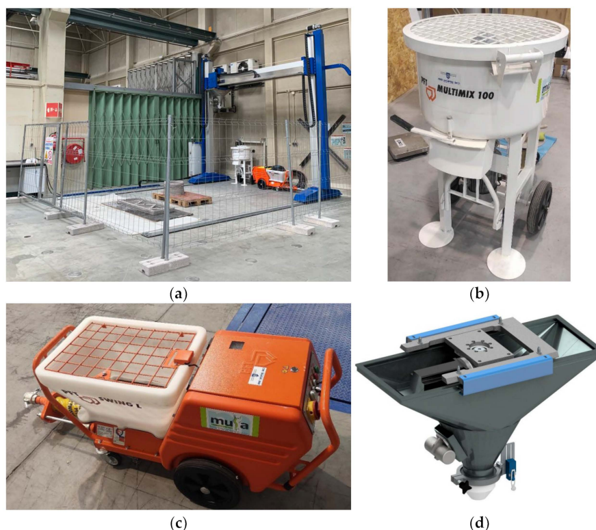
Figure 1. Gantry system constitution for 3DCP: (a) 3D printer; (b) mixer; (c) pumping system; (d) extruder with nozzle (from Be More 3D).

teristics that all designed mixtures must present [25–27] with some relevant references to experimental research.