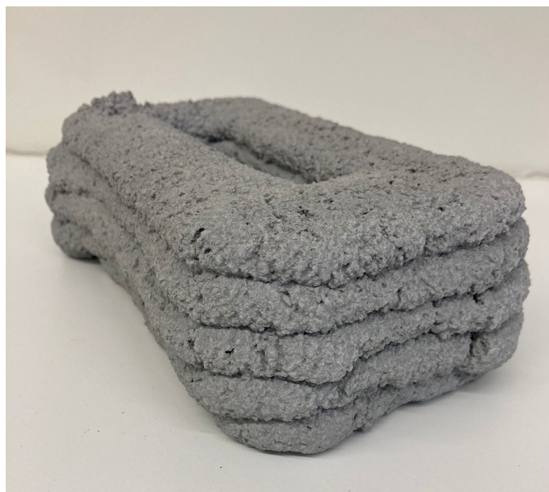
Figure 2. A 3D-printed element with a mixture based on SCBA.

Since fillers and tailings are the waste categories with substantial representation [79], clay brick powder, waste glass, and ceramic powders (e.g., table and sanitary ware, electric