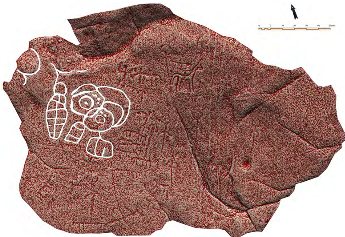
FIG. 5. First phase of engraving. Painting over the 3D model obtained by photogrammetry.

reason, they were included in this set of motifs, that correspond to the first and earlier phase of the rock engraving (Fig. 5).