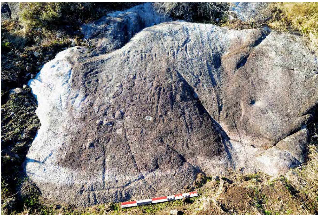
FIG. 3. Rock 6 from Monte de Porreiras viewed from the Southeast.

—diaclasses—. It measures 2,9 metres from east to west, and about 2 metres from south-southeast to north-northwest. On its top, the outcrop presents a slight elevation of about 0,60 metres in relation to the ground. The surface is profusely carved, except in its extreme edges, to the northeast and east (Fig. 3).