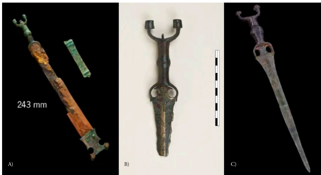
FIG. 9. A) antenna-hilted dagger from Os Castros, Taramundi, Asturias (Villa, 2009b); B) antenna-hilted dagger from La Peña Grande-Couboeira; c) antenna-hilted dagger with iron and bronze blade from Castro de Chao Samartín (Villa, 2009a).

One interesting feature of the carved weapons is related to the dimensions of the rain-guard, which is extremely exaggerated in relation to the length of the blade. This intensifies the anthropomorphic nature of the handles, since the raised arms of some of the anthropomorphs may indicate prayers or that they are able to establish contact with deities, suggesting the magic or religious power of these weapons.