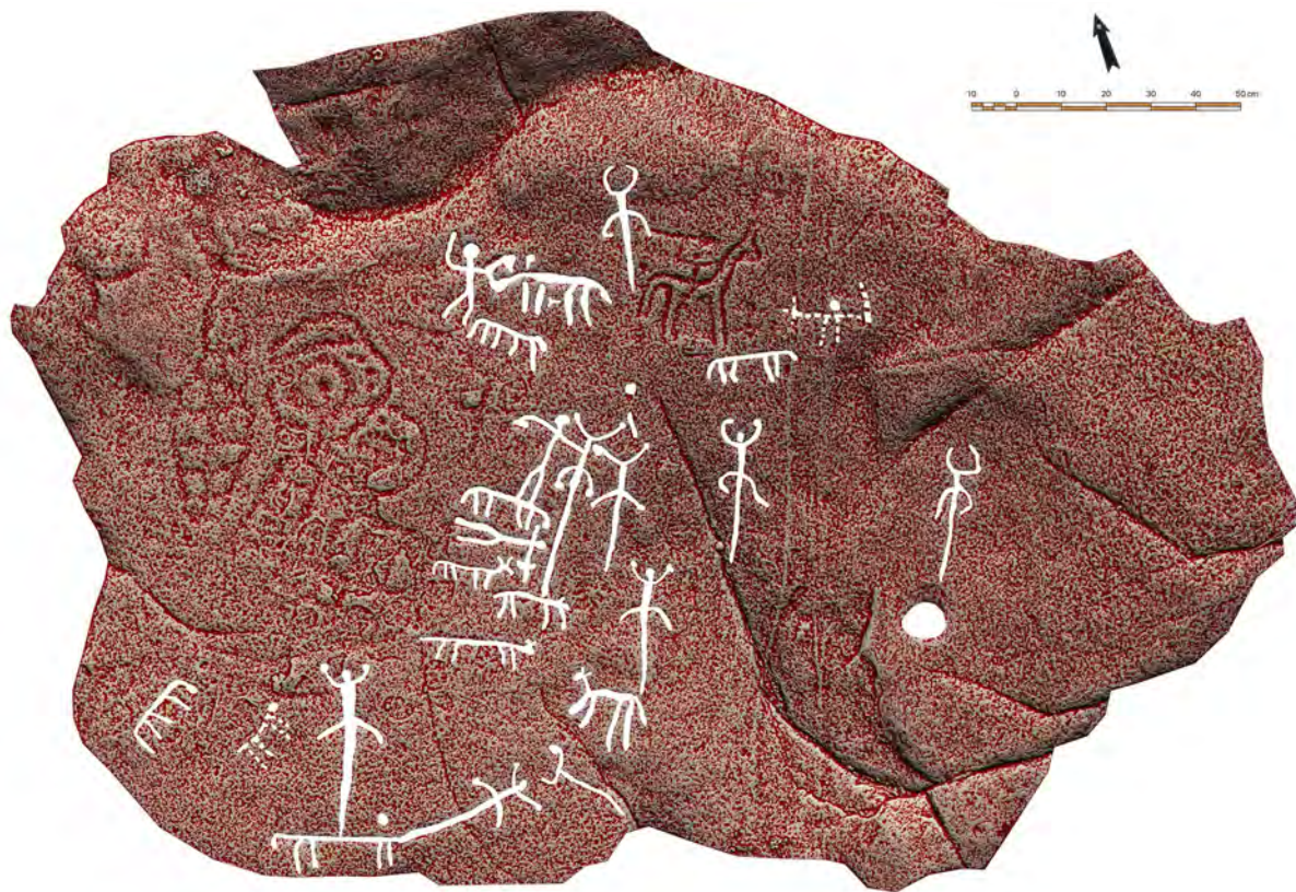
FIG. 6. Second phase of engraving. Painting over 3D model obtained by photogrammetry.

as if it was dead. This figure uses an object in its left arm that is difficult to identify. On the northeast side there are four antenna-hilted swords or daggers with well-defined grooves, almost suggesting a low relief technique. One of these weapons is pointed towards a natural shaft on the rock, as if entering it, and another one is isolated from the rest, in the northeast section of the composition, heading to a cup mark –a cavity or dimple–. A third weapon is pointed towards the back of what is supposed to be another motionless schematic ovidaprid, whose head, ears and tail are represented by well-defined grooves. This also suggests the death of the animal. At the bottom of the engraved surface, in the south, there are also another two big antenna-hilted swords or daggers pointed towards the same quadruped, one of which is pointing to its back and the other one to its head, nullifying it, as if it was cutting. Could this be the meaning of the cup mark