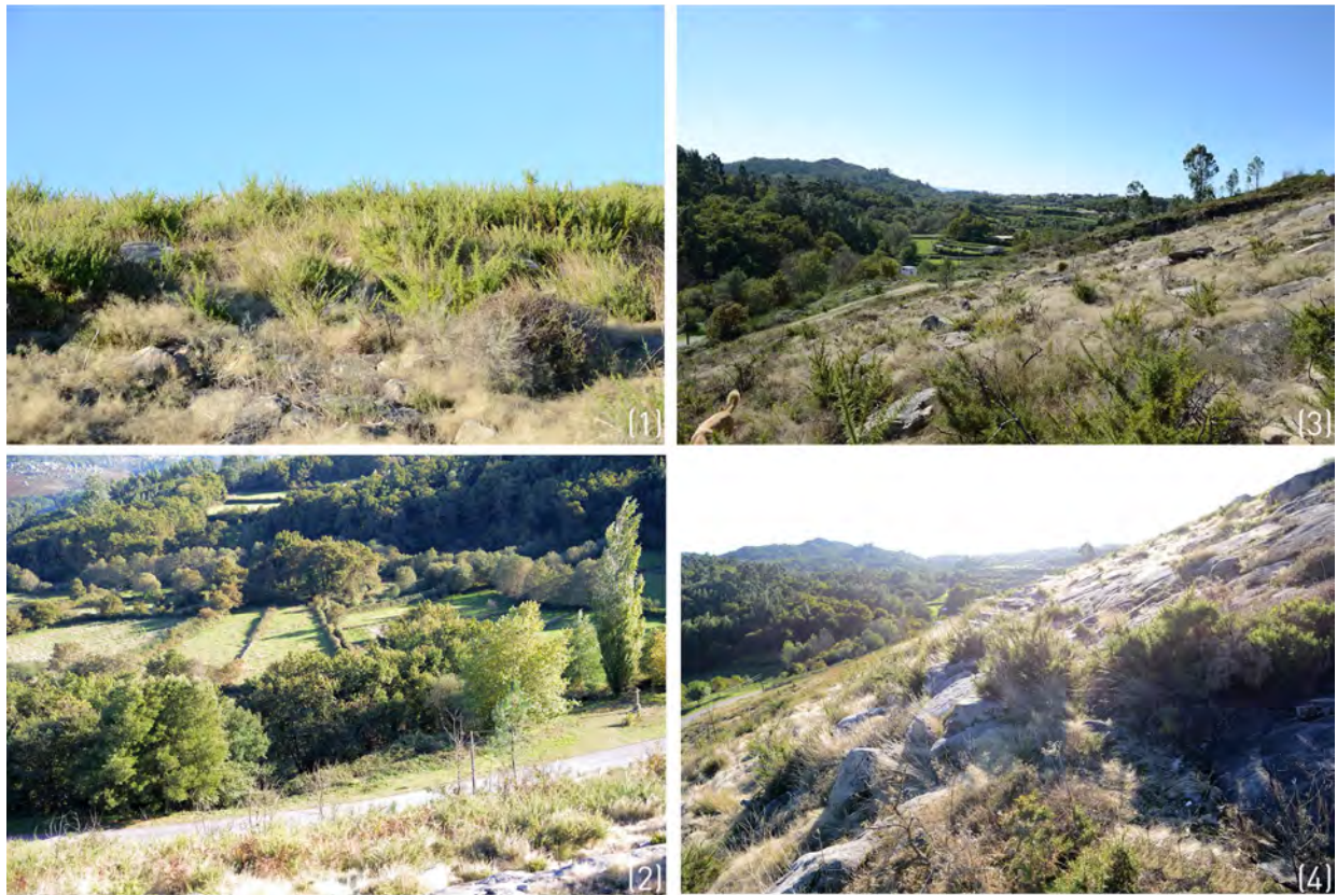
FIG. 2. Physical and environmental context of Rock 6 in Monte de Porreiras and its visibility to the surroundings: 1) North view; 2) South view; 3) West view; 4) East view;; this fourth image also shows the huge quantity of outcrops at the slope where the engravings were carved.