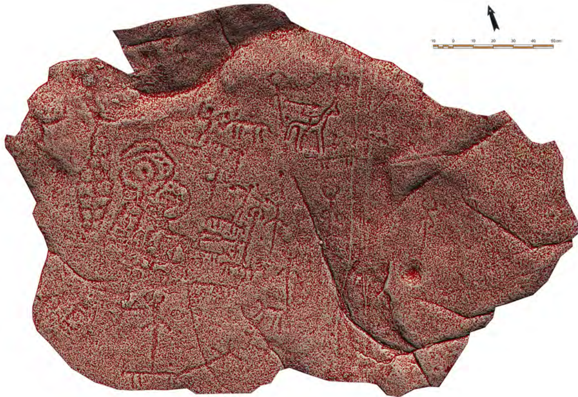
FIG. 4. Photogrammetric model of Rock 6 in Monte de Porreiras.

that are very characteristic of Classic Atlantic Art. It is possible to discern what looks like a concentric circle, with two loops superimposed by another concentric circle with two loops, with a central cup mark, whose external loop is extremely irregular. This is crossed by an irregular groove, which extends to the north and northwest of this composition, linked to a semicircle attached to the concentric circles. Between the first and the second loop of the concentric circles, several cup marks are visible. From each groove that extends to the south there seem to be reticulated motifs, which are barely visible due to the fact that they correspond to an extremely damaged section of the rock. These motifs flank a specie of imperfect ellipse, with a reticulated motif in the interior, topped by two semicircles, one of which is also subdivided. From the last semicircle there is a bifurcated groove that heads to the