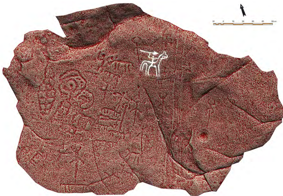
FIG. 7. Third phase of engraving. Painting over the 3D model obtained by photogrammetry.

arm, a javelin with a lozenge blade or point, in a throwing position. Its left arm is extended towards the neck of the animal, holding the reins. The rider is heading towards the northeast.