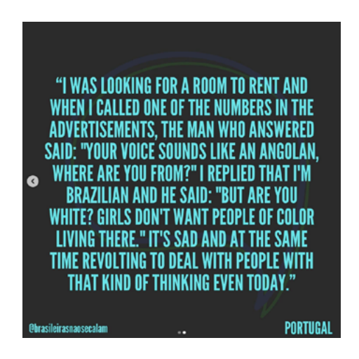
Figure 5 Instagram post @brasileirasnaosecalam

The latest data from the European Social Survey (n.d.) of 2018/2019 stem from this view, showing Portugal as one of the most racist countries in Europe. The study investigated the presence of biological and cultural racism in the country, and it found that racist inclinations were stronger in older and less educated individuals. 62% of the respondents showed racist behaviour, while only 11% completely disagreed with racism. In other words, according to this research, one in three Portuguese people affirmed racist beliefs, as illustrated in Figure 5.