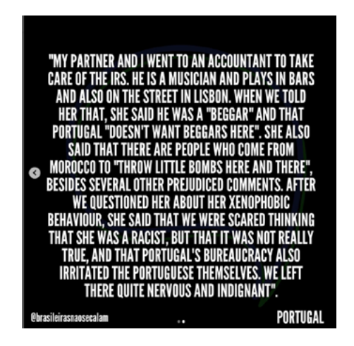
Figure 4 Instagram post @brasileirasnaosecalam