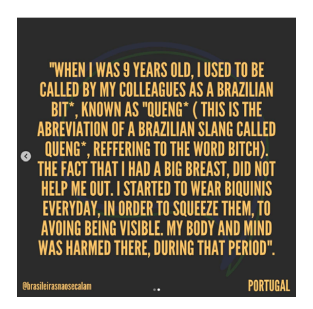
Figure 2 Instagram post @brasileirasnaosecalam