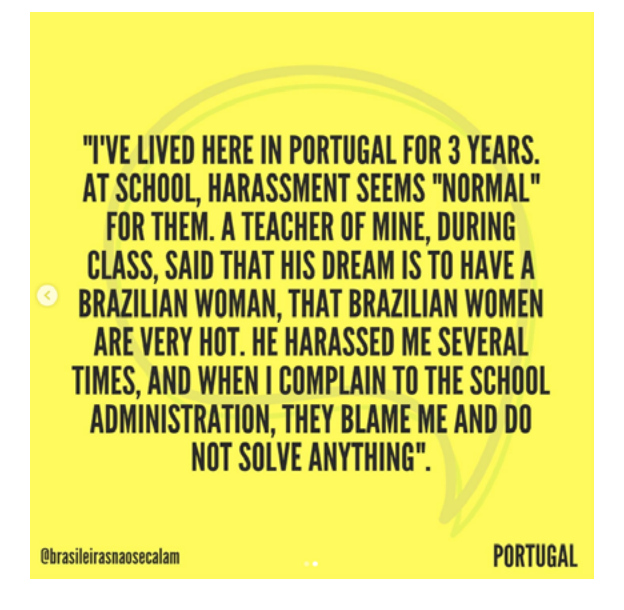
Figure 1 Instagram post @brasileirasnaosecalam

The profile publishes reports submitted via Instagram direct messages by Brazilian immigrant women. The posts are composed of text in Portuguese and English, and they are always made anonymously to protect the victims and avoid retaliation (Figure 1 and Figure 2).