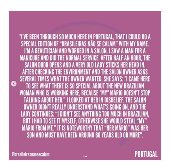
Figure 6 Instagram post @brasileirasnaosecalam

Since the "mothers of Bragança" incident, Brazilian women have been stigmatised as "man stealers", a stigma they face every day. That was abundantly clear in all the reports that were analysed, and it also comes across in the comments left by several women who experienced similar situations and carried that erroneous notion with them, as shown in Figure 6.