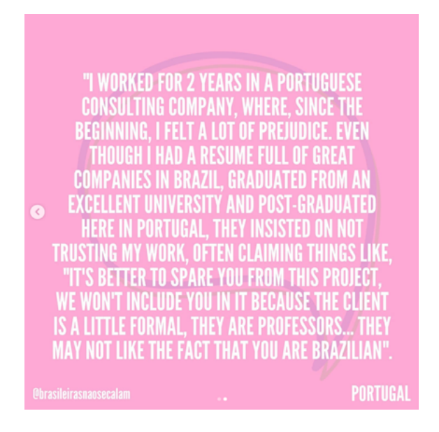
Figure 8 Instagram post @brasileirasnaosecalam