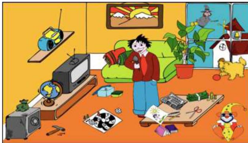
Figure 1. Picture 'Living Room' (from Yavas et al., 1991).

In addition to the background questionnaire, a picture of a living room was used to elicit oral production data in Portuguese (see Figure 1). This picture was chosen from a set of pictures used by Yavas et al. (1991) and adapted by the research team of the project Escreves como falas – falas como escreves? (EFFE) to evaluate oral and written language skills of EP-speaking children in Portugal (Lourenço-Gomes et al., 2016). The children were asked to imagine a situation in which they had just arrived home and found the scene represented in the picture. They should narrate the events prior to that moment and describe elements displayed in the picture, so that they would produce as many lexical items as possible. The interviewer presented herself as a Portuguese native speaker without knowledge of German in order to reduce the occurrence of code-switching.