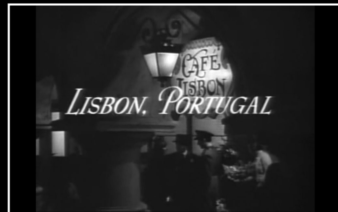
Lloyd Bacon [dir.]. "Affectionately Yours". USA. 1941.