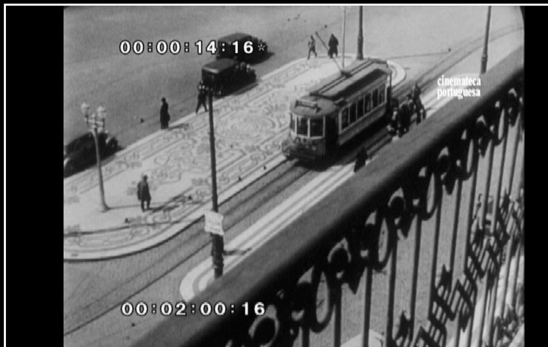
A/d [dir.]. "Portraits of Portugal". c.1937.