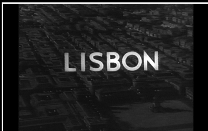
Tim Whelan [dir.]. "International Lady". USA. 1941.