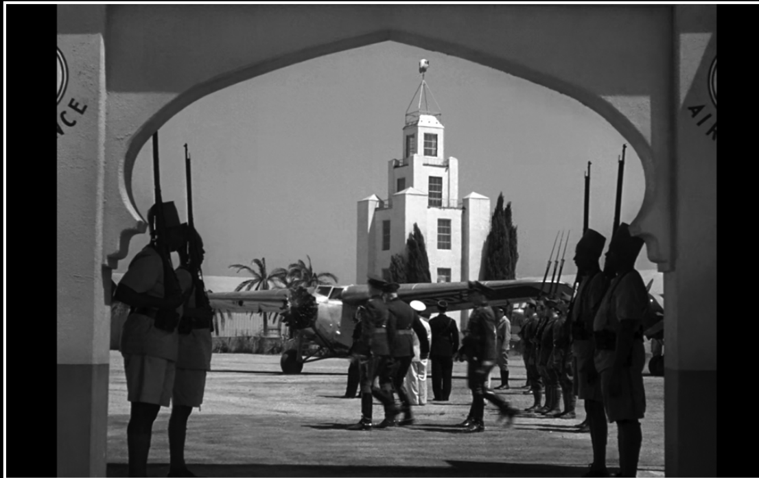
Michael Curtiz [dir.]. "Casablanca". USA. 1942.