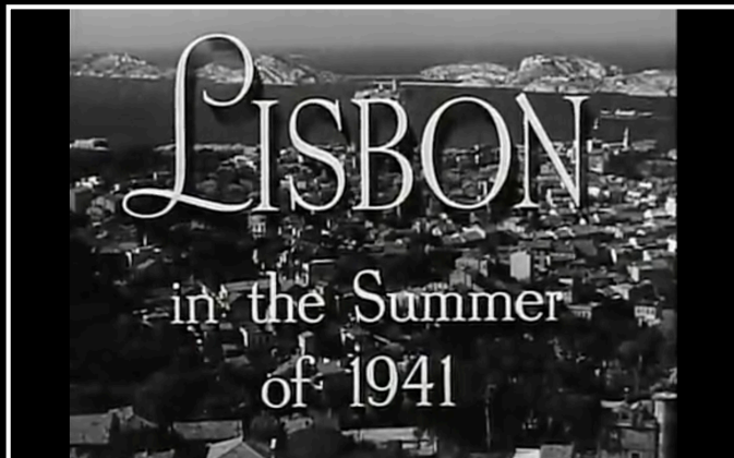
Richard Thorpe [dir.]. "Three Hearts for Julia". USA. 1943.