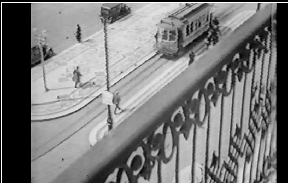
George Sherman [dir.]. "Storm over Lisbon". USA. 1944. © Republic Pictures Corp.