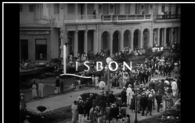
William Dieterle [dir.]. "The Last Flight". USA. 1931.