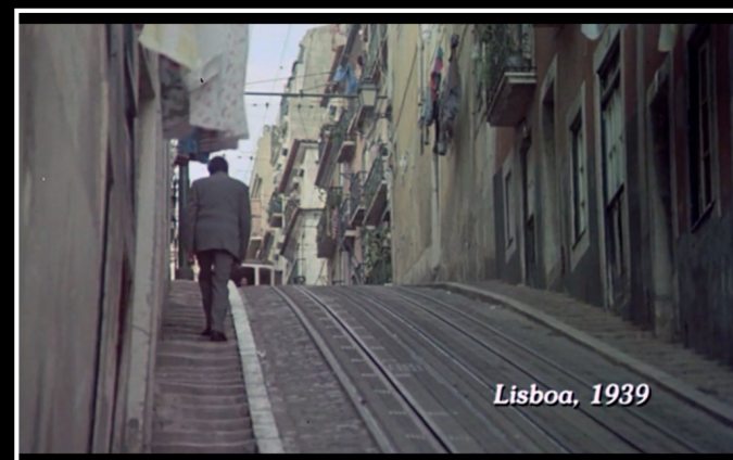
José Fonseca e Costa [dir.]. "Sem Sombra de Pecado". PT. 1983.