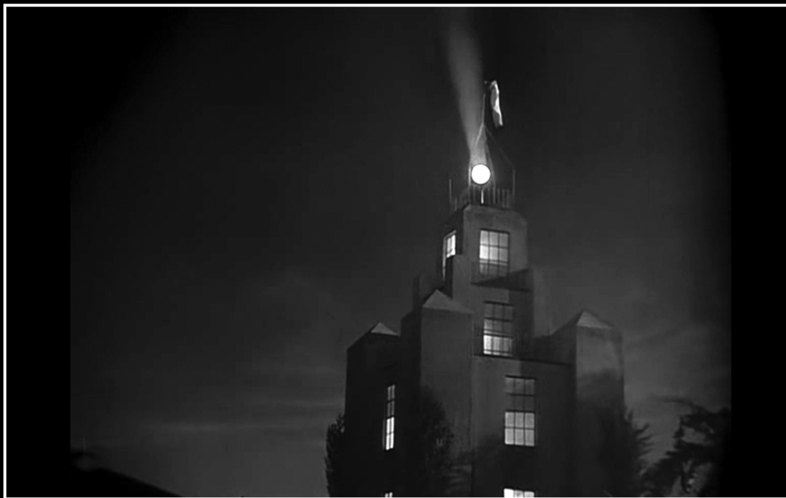
Jean Negulesco [dir.]. "The Conspirators". USA. 1944.