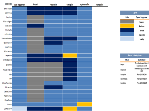
Figure 25: Stakeholders Engagement by project phase

Finally, a stakeholder engagement chart per project phase (Figure 5) was proposed, aiming to provide the project manager with an overview of the current stakeholders engagement in a given project phase, allowing to compare the current engagement in the different phases and with the desired target engagement that appears in the first column.