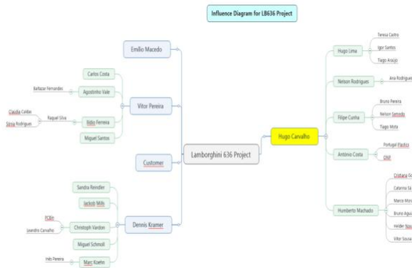
Figure 24: Influence Diagram from Lamborghini Project (Names are fictitious for confidentiality reasons)

Lamborghini in the pilot project, have a greater degree of influence on the project, while the stakeholders that are further away have a lower degree of influence on the project .