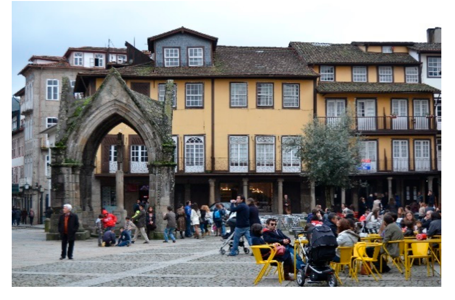
Figure 1. One of the more symbolic parts of the city centre in Guimarães.

Guimarães has 153,995 inhabitants and is the 15th largest city in Portugal today [39]. This is a slight decrease compared with the last census in 2011 (158,124 inhabitants). For centuries, the Ave Valley has been an industrial sub-region mostly focused on a few traditional manufacturing activities—textiles, clothes and footwear. Recently, Guimarães has tried to diversify its economy due to the decline of its traditional industries. Therefore, hosting the 2012 ECOC was seen as a promising opportunity to change this scenario by building on its historical heritage (Figure 1) to increase tourist flow, stir up the creative economy and address the decline in manufacturing employment.