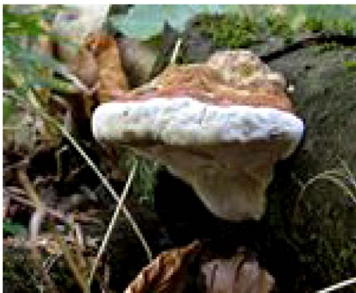
Fig. 1. A typical Ganoderma basidiocarp.

“Lingzhi” is the Chinese name given to the basidiocarps (my preferred name) of Ganoderma as isolated in that vast and diverse country. However, there is a tendency for authors in the scientific literature to refer to such names making definitive conclusions more difficult (see Huie and Di, 2004). The preparation was and is considered to have healing properties to the body and mind: “Lingzhi” is still revered by some. The preparation does indeed contain certain bioactive ingredients (such as triterpenes and polysaccharides) that might be beneficial for the prevention and treatment of a variety of ailments. Remarkably, these include such very important diseases such as hypertension, diabetes, hepatitis, cancers, and AIDS. These types of biomedical investigations have been conducted predominately in China, Korea, Japan and the United States of America and so are extensive. It is unclear why other countries are not more involved.