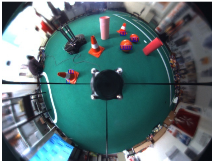
Figure 6: Example of misclassification between ball and road cone.

Two short movies were recorded to show the software working on a real environment, the first video shows the classification of some parts of the image 1 whereas the second one shows the classification for the whole image 2 .