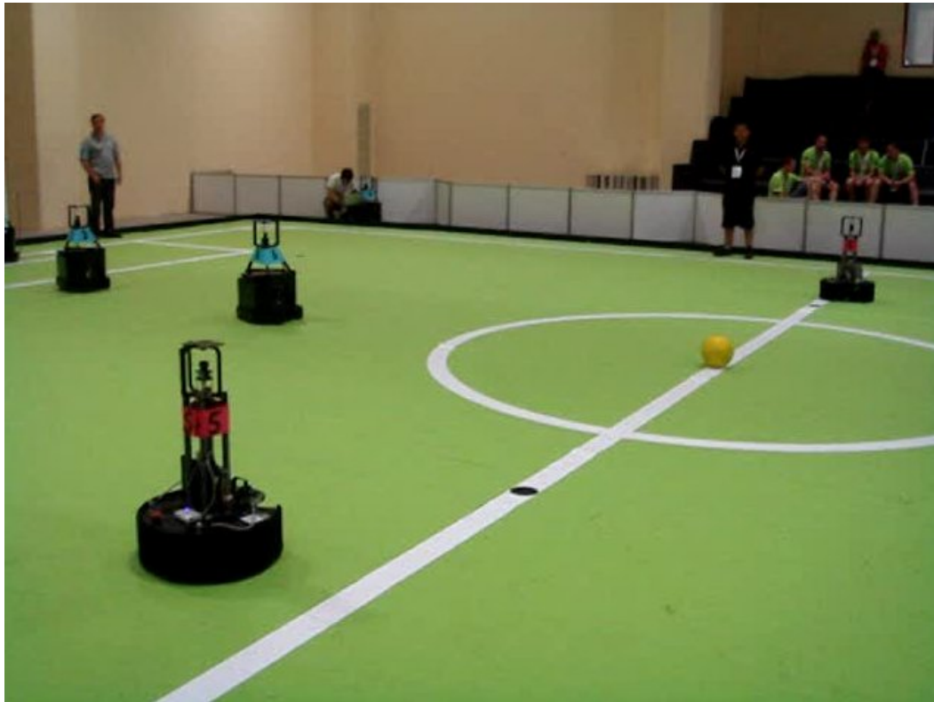
Figure 1: Soccer robots - RoboCup middle size league.

video camera is one of the most important sensors on this league, and can be used for the localization and obstacle avoidance tasks. However, these tasks can be seriously affected due to the vision system that is disturbed during light conditions changes. Algorithms for image processing and computer vision must be robust against several conditions such as fast moving robots, light conditions variations, vibrations, image occlusion and so on. Figure 1 shows a game for the RoboCup middle size league where some entities of the game can be seen, such as soccer field, robots and ball.