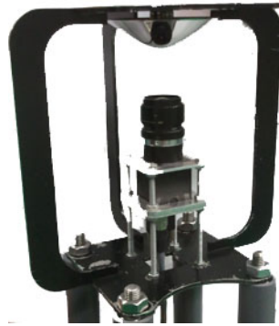
Figure 2: Omnidirectional vision system: parabolic/conic mirror facing downwards and a color camera facing the mirror.