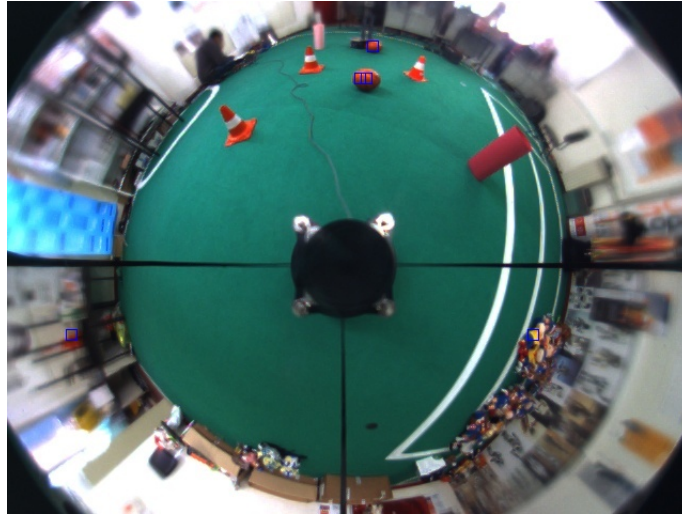
Figure 5: Ball reliably classified (blue square) after an insertion of new elements

ball color. An input sample containing the road cone may generate an ANN's output as [-1 \ 1 \ -1] rather than [-1 \ -1 \ 1] as expected, once it has to be classified as "other elements". A tolerance value, which is the difference between the desired output and the current ANN's output, was used to solve this misclassification. Several experiments demonstrated an ideal tolerance value of 0.3. Figure 6 shows a tolerance value of 0.5 in order to show a misclassification between ball and road cone.