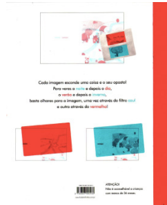
Fig. 3–Back cover of Olá Adeus , by Delphine Chedru, showing a visual explanation of book's main mechanism.

More specifically, the book's architecture consists of two contrary words (antonyms) such as, for example, small/large, captive/free, light/heavy, good/evil, printed on the odd pages in light blue and red; on the even pages, there is a visual composition of mixed elements also printed in light blue and in red. Using the double filter, the reader is supposed to carry out a cross reading and a matching exercise between the blue words and blue illustrations and the red words and red illustrations. The linguistic parsimony is in stark contrast with the visual richness of this book, which contains pictures that recreate detailed indoor and outdoor scenes, terrestrial and aquatic, natural or urban, faces, different situations of everyday life, especially common in children's daily life, among others.