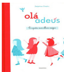
Fig. 2–Front cover of Olá Adeus , by Delphine Chedru.

2.2 In Olá Adeus [ Hello Goodbye ] (2015), by Delphine Chedru, as the title suggests, antinomic duplicity is the key element in both the text/image construction, and the “transformation tool” attached to the book—a piece composed of two sheets of acetate, one red and one light blue—as well as in the actual physical action that the reader must perform.