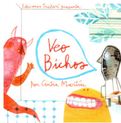
Fig. 4–Front cover of Vejo Bichos , by Cintia Martín.

2.3 Vejo Bichos [I see animals] (2015), by Cintia Martín, is perhaps [the least-known book of the set under discussion, as it has been edited by a small Spanish independent publisher, Ediciones Tralari, also responsible for the publication, for example, of the set of minimal narratives entitled "Cuentos infinitos".