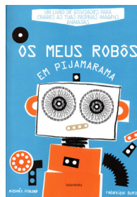
Fig. 7–Front cover of Os Meus Robôs em Pijamarama , by Michael Leblond and Frédérique Bertrand.

Os Meus Robôs em Pijamarama [My Robots in Pyjamarama] (2014), the third book by Leblond and Bertrand, is a thematic volume of activities in which the challenge is to build animated robots, with recourse to colouring pencils, to drawing and painting, and with the use of a “magic grid”, i.e., an accessory consisting of a striped transparency.