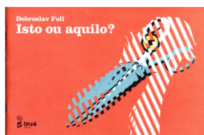
Fig. 1–Front cover of Isto ou Aquilo , by Droboslav Foll.

2.1 The book composed by Droboslav Foll, Isto ou Aquilo? [ This or That? ] (2011), first published in the Czech Republic in 1964, is a visual sequence of 16 double images i.e., two visual representations with the same or similar formats whose identification and decoding is only possible if the recipient lays a transparency with diagonal grey stripes over them and moves it from right to left and vice versa, a duality/duplicity that the question in the title suggests.