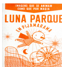
Fig. 6–Front cover of Luna Parque em Pijamarama , by Michael Leblond and Frédérique Bertrand.

In fact, for action to take place, the reader has to act on the books by sliding a striped transparency over their pages, from one side to the other. The movement seems very realistic, and thus the static pages of the books become endowed with an attractive dynamism.