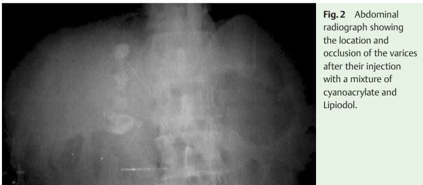
Fig. 2 Abdominal radiograph showing the location and occlusion of the varices after their injection with a mixture of cyanoacrylate and Lipiodol.