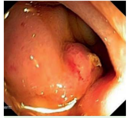
Fig. 3 Follow-up endoscopy 2 weeks later showing obliteration of the ectopic varices.

Ectopic variceal bleeding is a rare cause of gastrointestinal hemorrhage, representing up to 5% of all variceal bleeding episodes [1]. The most common cause of ectopic variceal bleeding is portal hypertension (from both intrahepatic and extrahepatic causes) [2]. In the absence of portal hypertension, other causes may include abdominal surgery, abnormalities in the venous outflow vessels, abdominal vascular thrombosis, hepatocellular carcinoma, pancreatitis, and familial syndromes [2,3]. Ectopic variceal bleeding can pose a diagnostic dilemma and endoscopy plays a major role in the diagnosis and treatment of this condition.