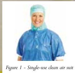
Figure 1 - Single-use clean air suit

“the correlation between a low surgical wound infection rate and a high microbiological air cleanliness during the operation has been demonstrated”