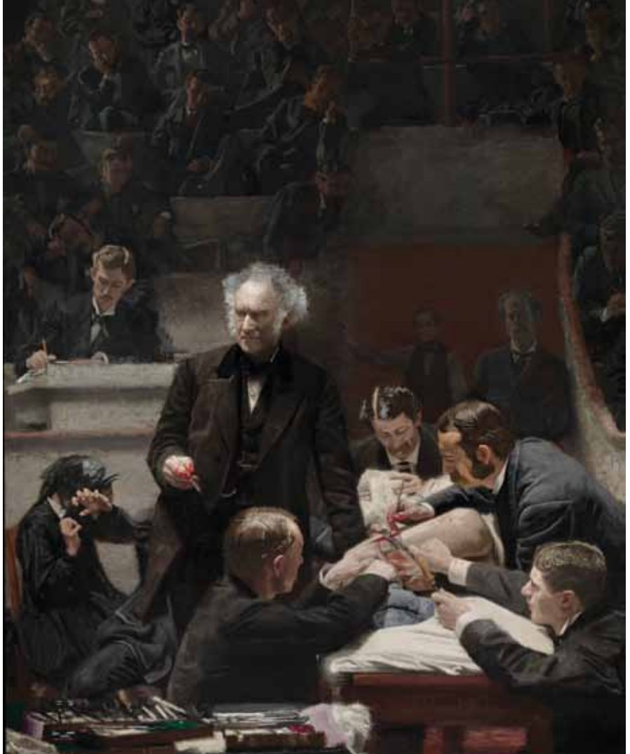
Thomas Eakins, The Gross Clinic , 1875 (Dustin Kidd 2004)

Throughout the Twentieth Century, a number of materials were used in the manufacture of surgical clothing for use in the OR. Woven textiles such as carded cotton, often referred to as muslin, were considered most suitable for this application. This material was easy to purchase, easy to work, economic and seemed to have the characteristics considered to be an acceptable barrier.