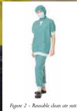
Figure 2 - Reusable clean air suit

and performance levels'. This document will supersede those parts of pr EN 13795 (2010) that deal with clean air suits.